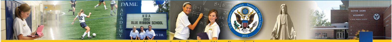
An e-Newsletter for the Families of Notre Dame Academy