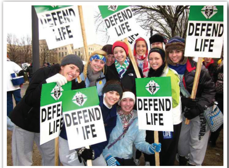
Marching for Life is a tradition for NDA students!